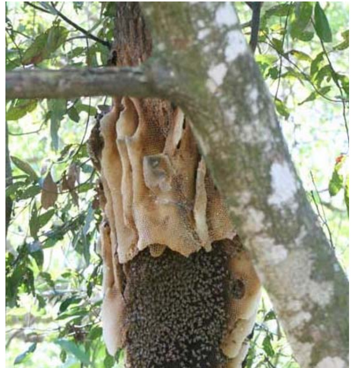
A honey bee colony in the wild

In scientific terms, bees are in the insect superfamily Apodidea . This superfamily includes lots of families, subfamilies, tribes and approximately 20,000 bee species. The bees in each family have traits in common, like methods for building nests. Different species usually have different physical traits, like wing shape or tongue length.