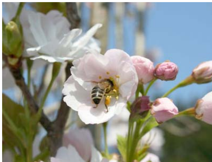
The baskets on this bee's hind legs, made of hair, are full of pollen.

The abdomen has almost no appendages, but it houses nearly all of the bee's internal organs. Passageways called spiracles allow the bee to breathe, and a network of tubes and tracheae carry oxygen into the bee's body. An aorta in the thorax pumps blood, or hemolymph, directly over the organs rather than through a system of vessels. Oxygen floats in the hemolymph without the use of red blood cells, so the fluid is colorless instead of red. The abdomen also holds a tube-like digestive system that includes a crop, or honey stomach, where the bee holds nectar.