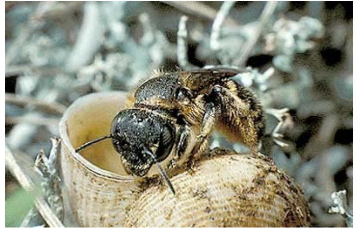
Some bee species use snail shells to make their nests.

Many people are most familiar with social bees because they can be more visible than solitary bees. Many social species produce substances that people use, like honey and beeswax, and people can see large groups of social bees feeding in orchards and gardens. But most bees aren't social -- less than 15 percent of bees live in colonies. The rest are solitary. They may exhibit some social tendencies, but they don't build large hives or store lots of extra honey. Instead, they build small nests that are big enough to hold a few eggs or a single egg. Sometimes, lots of solitary bees build their nests close together, but with the exception of mating and the occasional group defense of the nest site, these bees do not usually interact with each other.