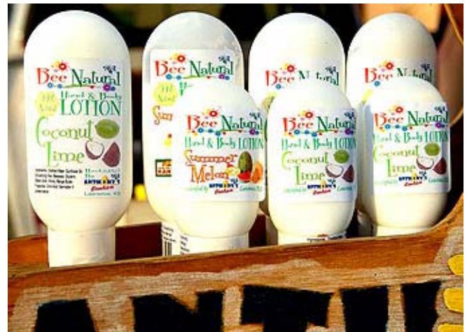
Anthony's Beehive Bee Natural Hand & Body Lotion on display at the Downtown Lawrence Farmer's Market in Lawrence, Kansas.