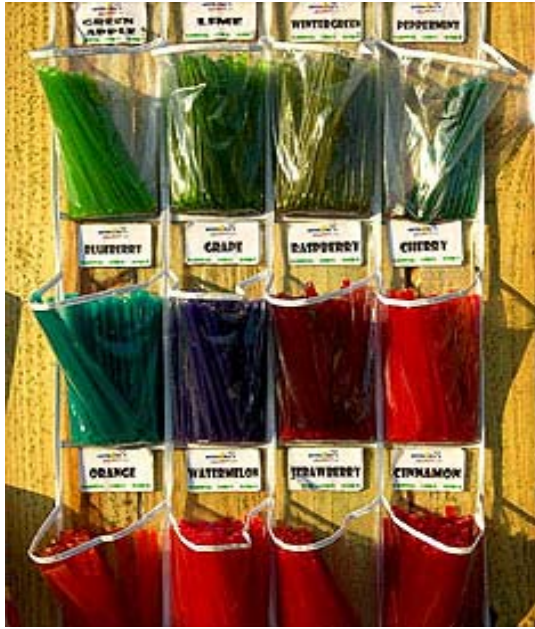
Anthony's Beehive Bee Honey Straws in a variety of flavors on display at the Downtown Lawrence Farmer's Market.