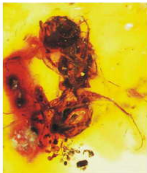
This oldest bee fossil to date was found in an amber specimen from northern Myanmar.