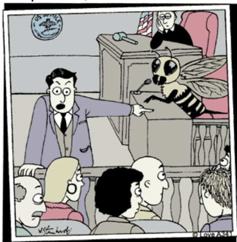
"The defendant had the motive, he had the opportunity, and let's face it, he's a killer bee."